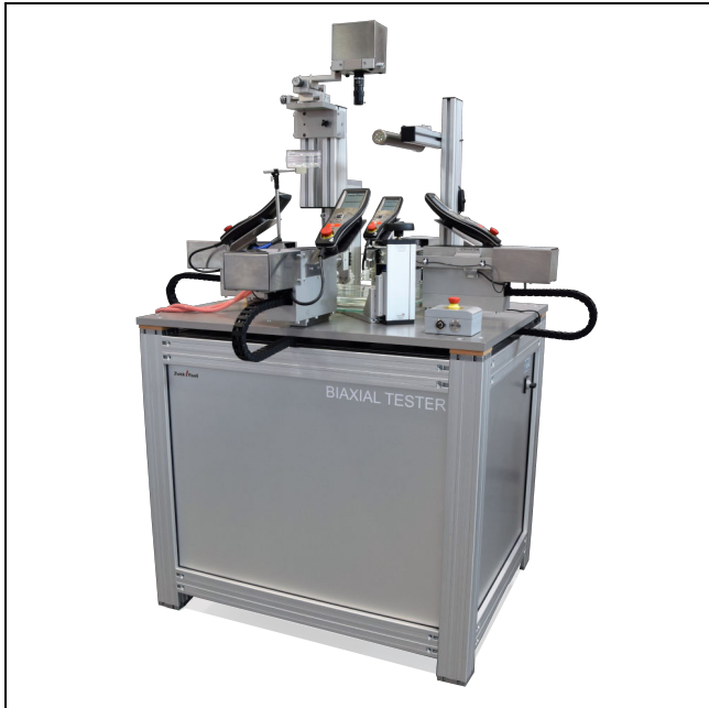
Biaxial testing machine